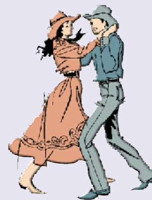
Quick Quick... Slow Slow

This newsletter can be viewed on line at www.mikeponte.com