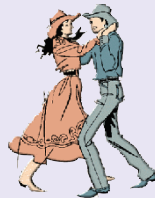
Quick Quick... Slow Slow

This newsletter can be viewed on line at www.mikeponte.com