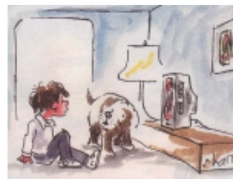
"When I was your age, I was 49"